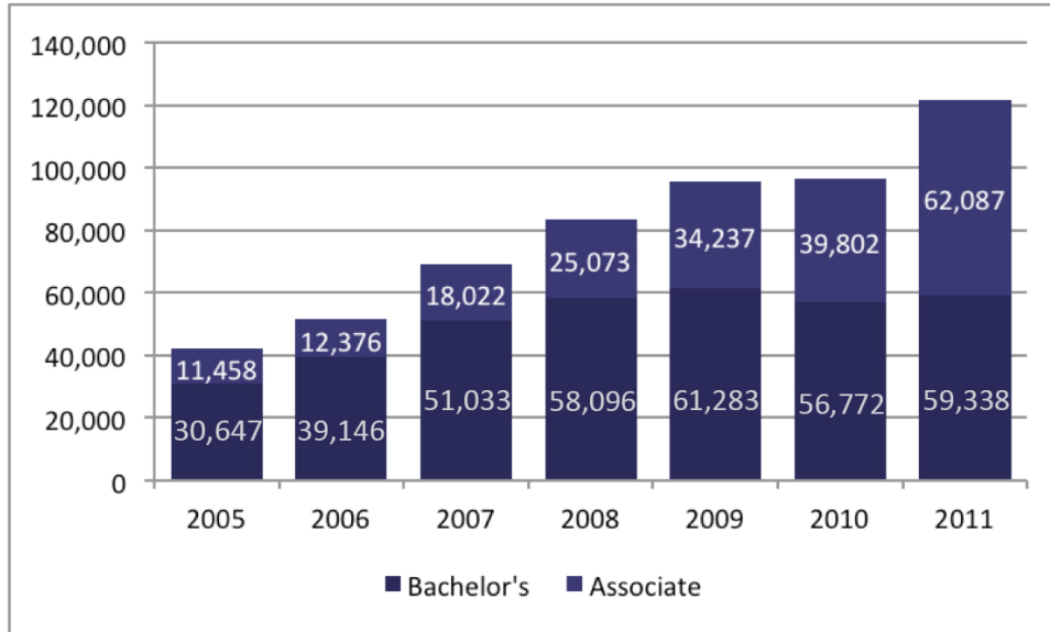
Figure 2 – ACBS Registered Learners by Year

Of particular interest in Figure 2 is the growth in degrees awarded annually. After slow growth in its first few years of operation, the number of degrees awarded expanded dramatically after 2005. In that year, ACBS gave out just under 14,000 degrees, roughly 71% of which were at the Bachelor’s level. Four years later, the number more than tripled to just over 48,000 degrees, again with roughly 71% being at the Bachelor’s level. The year 2009 was the high-point for Bachelor’s degrees awarded through ACBS; in that year, 34,058 were awarded, meaning that ACBS was responsible for more than one in ten of all undergraduate degrees awarded in South Korea that year. Since then, 4-year degree numbers have fallen substantially. In fact, the number of Bachelor’s degrees awarded dropped by a third between 2009 and 2011, from over 34, 000 to 22,769. At the same time as the number of Bachelor’s degrees awarded has declined, the number of Associate’s degrees awarded has spiked. Between 2009 and 2011, the number of Associate’s degrees awarded more than doubled, from 14,058 to 29,585. In 2011, nearly 16% of all junior college degrees in Korea were awarded through the ACBS.