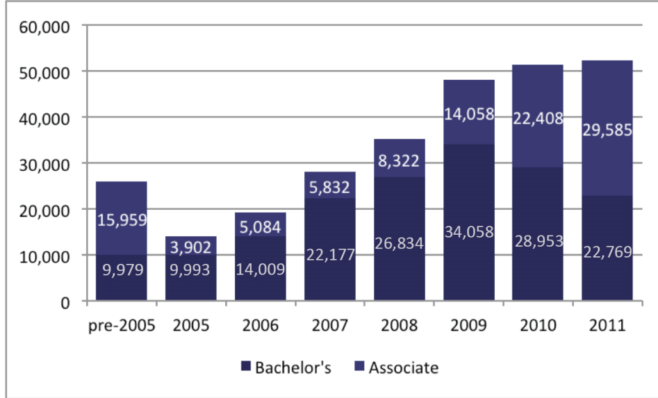
Figure 3 – ACBS Degrees Awarded by Year

The cause for the sudden growth in Associate’s degrees is fairly straightforward. Nearly all of the growth occurred in just two fields of study: child care and social work. These two fields are suddenly in demand because of changing demographics (declining working-age populations mean more women are being drawn into the workforce), and increasingly strict daycare licensing requirements. Korean birthrates have fallen well below replacement rate (1.21 per woman), which means that the average age in Korean society is increasing rapidly. This has led the government to push for human resource development in these areas, requiring new practitioners to have post-secondary certifications.